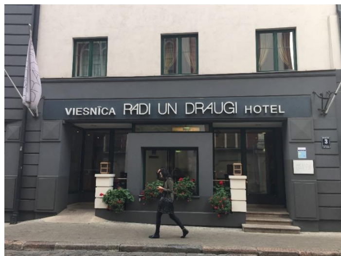
Hotel Radi Un Draugi (Event Venue)

https://drive.google.com/open?id=1Vl7tUp_cyCITFbt8cpvKVak4Ttcn4t4K&usp=sharing