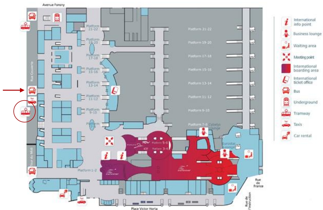
The stop for tram 81 is located outside the Gare du Midi, highlighted by the arrow in the image above.

The International Associations Centre can be accessed from Gare du Midi train station. From Gare du Midi/Zuid Station, take the tram 81 in the direction of Montgomery and stop at Bailli. From there, it is a short walk to the International Associations Centre.