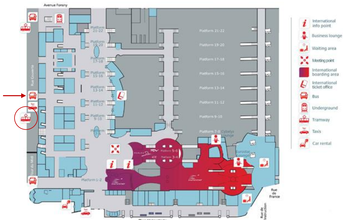
The stop for tram 81 is located outside the Gare du Midi, highlighted by the arrow in the image above.

The International Associations Centre can be accessed from Gare du Midi train station. From Gare du Midi/Zuid Station, take the tram 81 in the direction of Montgomery and stop at Bailli. From there, it is a short walk to the International Associations Centre.