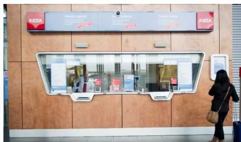
Reloadable travel cards are only available for purchase at certain metro stations (such as at Gare du Midi), from manned kiosks.

If you come to Brussels often, you may consider purchasing a reloadable card (costs €5) which allows you to buy ten trips for €14 from any of the STIB/MIVB GO machines. This card, however, is not available for purchase at the GO machines; you would need to buy it from the manned kiosk inside the Gare du Midi metro station.