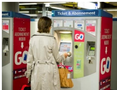
You may purchase individual tickets or reload your travel card at the GO machine (however, reloadable travel cards may not be purchased here).

Tickets for tram 81 may be purchased from the driver for €2.50 (please have correct amount), or you may purchase your ticket from the STIB/MIVB GO machine (there is a GO machine outside the Gare du Midi station, in the area of the tram).